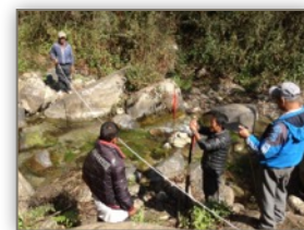
Preparing the site

This project includes the construction of intake works and three pipelines: one 1,040 m (Sano Bhugdeu), one 3,000 m (Patwaal) and one 5,140 m (Syauri and Pangu Besi). It should be noted that these three pipelines will