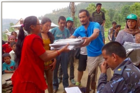
Distribution of blankets in Nepal in 2015

earthquakes in Nepal, both in Quebec and in Nepal. In Quebec, he was in close contact with the media in order to raise funds. He also travelled to Nepal to support the local team in its distribution efforts, making sure that aid reached the right people.