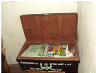
Pedagogical material for one classroom