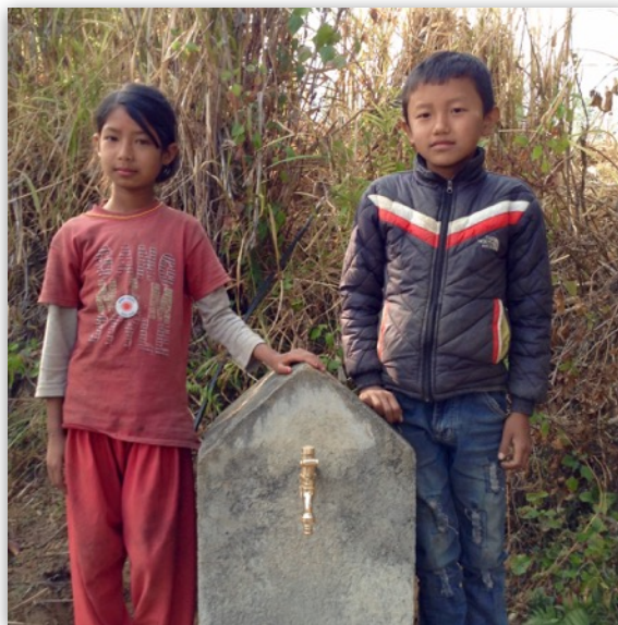
Existing water tap

Following the 2015 earthquakes, these two villages (as well as many others) don't have enough water. This is why the villagers chose to go and get their water, by gravity, from a high output water source located 5.1 km from the villages, and to connect it to the existing distribution system. It should be noted that this system was upgraded in January 2018. It's a long distance but it is important to choose a water source that is upstream from the last houses in order to ensure that the water is potable.